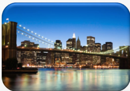
New York 8,398,748